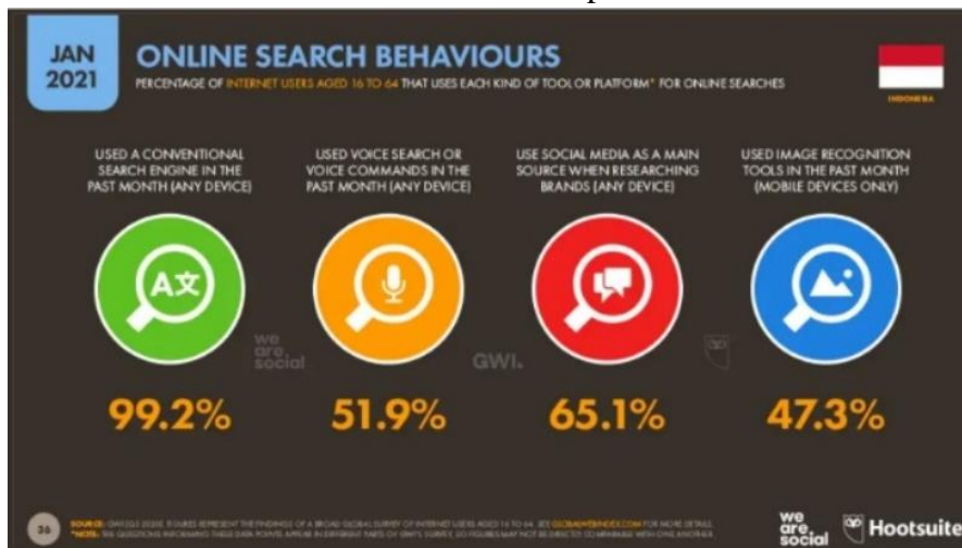
Picture 1. Online Chart of Indonesian Population Behaviours in 2021

However, there is a separate problem that still has to be seen by producers who use social media as one of their marketing tools, this is the use of a payment system that still uses an offline system or better known as cash on delivery. Based on the data obtained from globalwebindex in 2021, it shows that 65.1% of Indonesian consumers are looking for information related to the product or brand through social media.