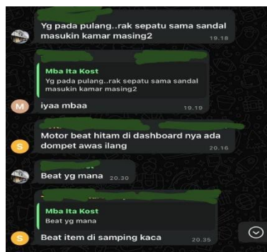
Figure 6. Resource Person Information 3

The third resource person stated that WhatsApp has an important role as an information medium by providing notifications and reminders for boarding house residents to take care of their belongings. The resource person also emphasized that WhatsApp plays a very important role in disseminating information because it allows the dissemination of information anywhere and anytime.