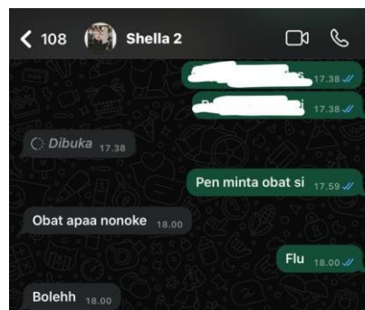
Figure 3. Interaction of Resource Person 3

Resource person 3, Sindi Solihatun Adha: "The whatsapp interaction that I do with other boarding house children that I know the most, when fasting is to tell each other suhoor, like an appointment to wake each other up, the same promise to buy suhoor together, and then I have also asked for medicine when I am sick with other boarding house residents. On the positive side, my interaction through whatsapp is that whatsapp is easy to use as a place of communication, it's not complicated, there are many features. The downside is, before I saw the messages sent by other people, they were pulled in a hurry, so I haven't seen the messages, sometimes it makes me curious about the content of the chats."