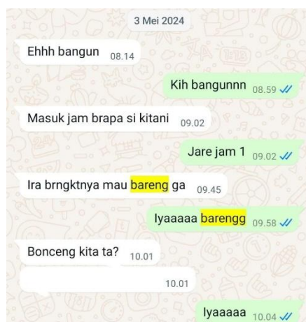
Figure 1. Interaction of Resource Person 1

Resource person 1, Shella Nurazizah: "The interaction that occurred using WhatsApp between me and my roommates, such as an invitation to go to campus together, this is just when my friend and I want to go to college. I chatted with my friends via private message on WhatsApp to leave together. In my opinion, the positive role of interaction through WhatsApp is like the convenience of chatting with other people, continuing to send photos and videos, and making phone and video calls. This can also be used to overcome the problem of boarding school students, this convenience can be used when boarding school students are in distress and need help from other parties. For example, if I am sick, this convenience can make me quickly ask for help from others via WhatsApp. The negative side of interaction through WhatsApp is that the most, like a long reply from the person I am chatting with, or it can also be when the call or video call is not answered with the person I call. The problem, in my opinion, is that it is important to interact with others. To overcome the problem of boarding school students, this is a big loss because it results in being late when I am in a hurry to do something"