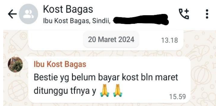
Figure 4. Resource Person Information 1