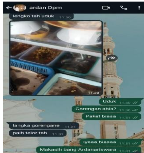
Figure 2. Interaction of Resource Person 2

The second resource person explained that WhatsApp acts as an interaction medium to ask for help, such as asking for help to temporarily store packages left outside the room when the resource person returns home, WhatsApp is also useful for asking for help buying food needed by the resource person. In addition, WhatsApp also functions as a medium for interaction with resource persons to joke with other boarding house residents. The resource person also explained the positive side when interacting through WhatsApp, such as WhatsApp is easy to use and has features that are easy to understand. The negative side when interacting via WhatsApp is that the resource person has been blocked for no reason by other boarding house residents.